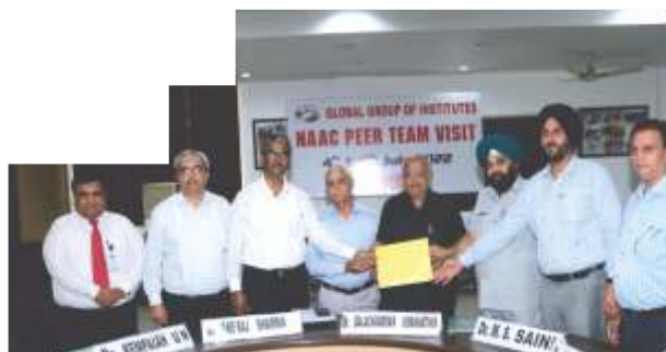
The Peer Team Report being shared with the Head of the Institution