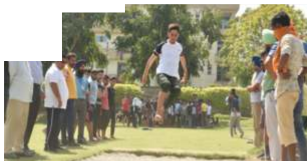
Athletic Events At Annual Sports Meet