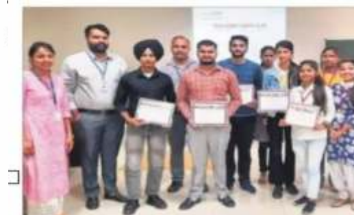
Students during the inter-departmental activities held at Global Group of Colleges in Amritsar on Monday.