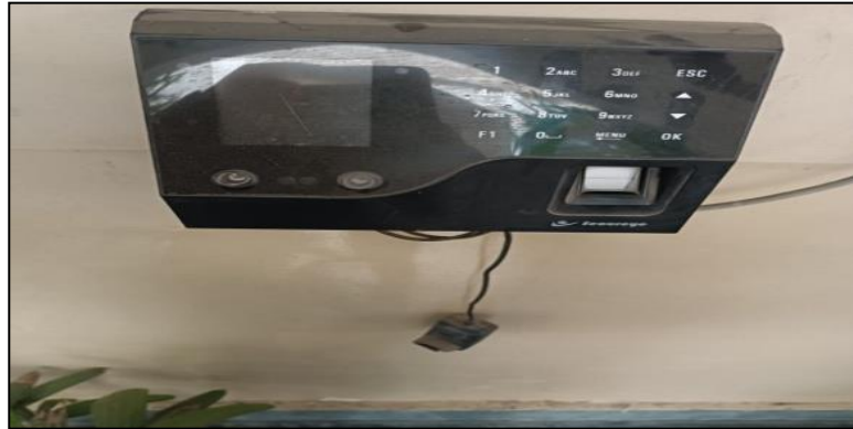
Machine 2 (Installed in SC/ST Cell)