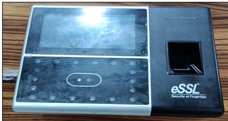
Machine 3 (Installed in Admin Block)