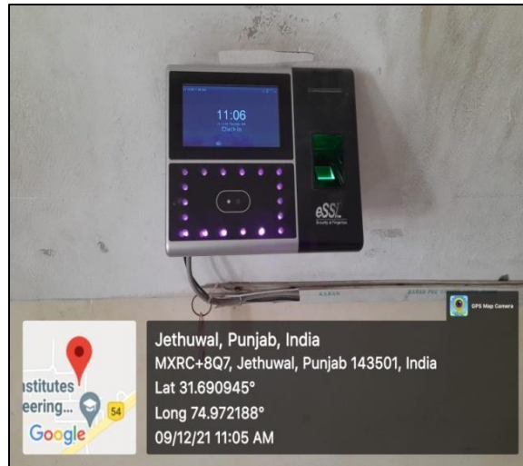
Machine 1 (Installed in Chemistry Lab)