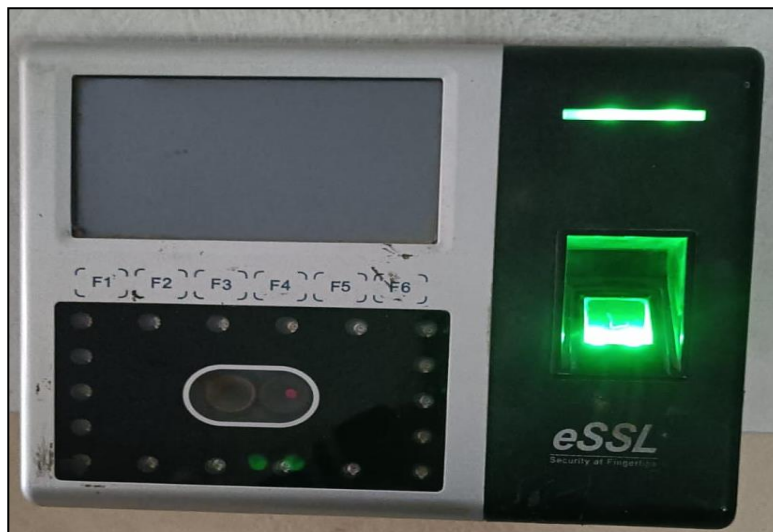
Machine 4 (Installed in Physics Lab)