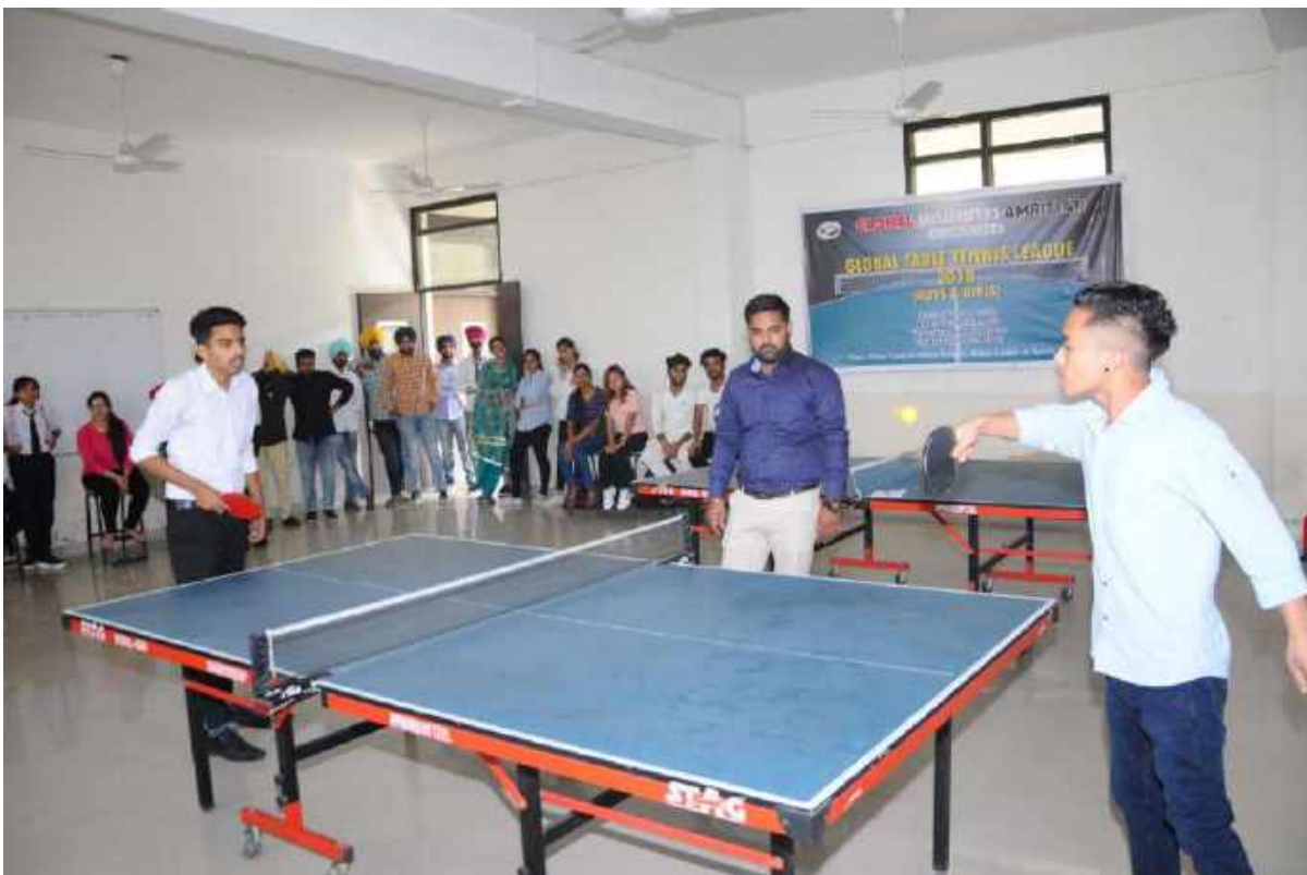
Table Tennis League was organized in the campus of GIMET, Amritsar for a week. Many students participated energetically in the event. Table tennis can be played with one player at each end of the table, two players at each end, or one of each. Table tennis is quite popular as a recreational game, and it is played in a variety of sports clubs, social clubs, and gaming rooms, as well as in the house and even outside when the weather is sufficiently calm.