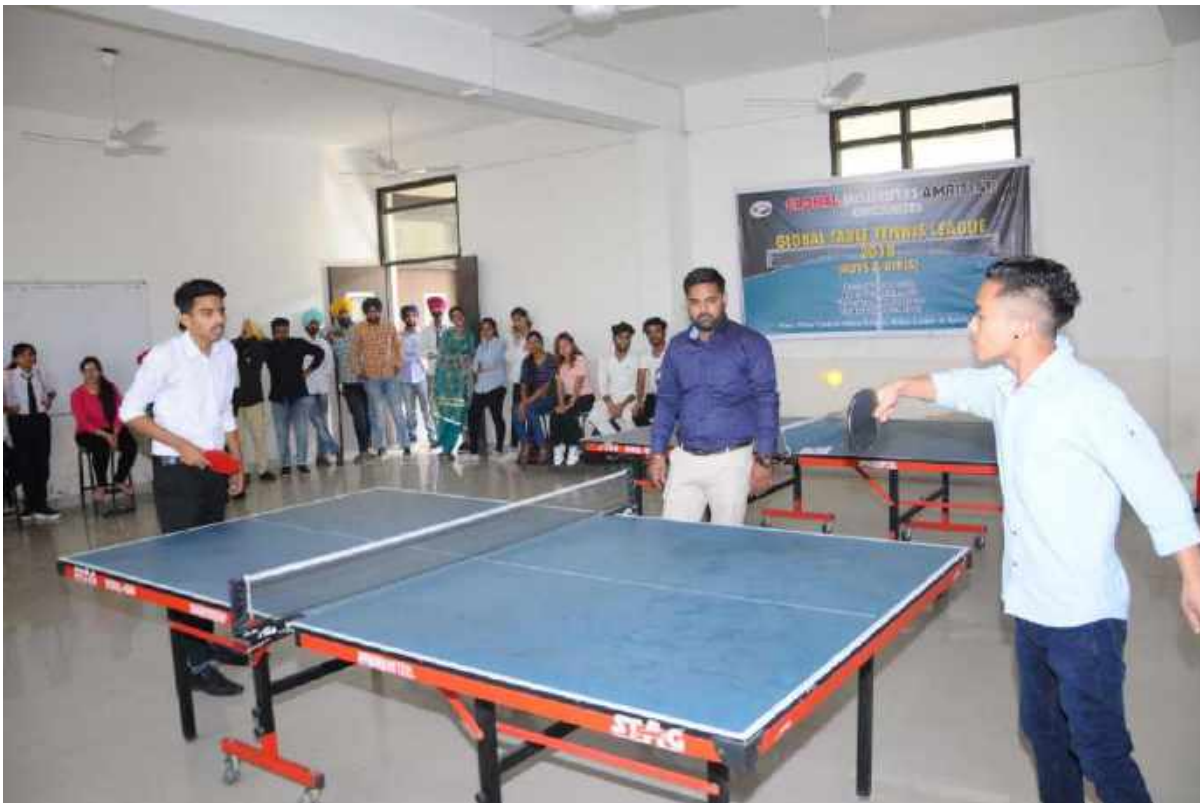
Table Tennis League was organized in the campus of GIMET, Amritsar for a week. Many students participated energetically in the event. Table tennis can be played with one player at each end of the table, two players at each end, or one of each. Table tennis is quite popular as a recreational game, and it is played in a variety of sports clubs, social clubs, and gaming rooms, as well as in the house and even outside when the weather is sufficiently calm.

11 th km stone, Sohian Khurd, Amritsar-Batala Road, Amritsar.